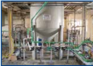
Marine chemical manufacturing with IMO, NSF and GMP certified products