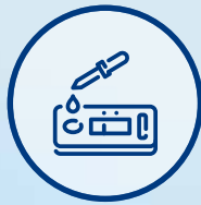
Marine test Kits and reagents