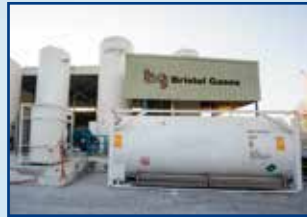
Marine gases manufacturing