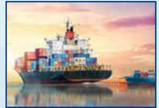
Global marine supplier with a wide network of ports