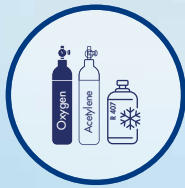
Industrial, Refrigeration and Span Gases