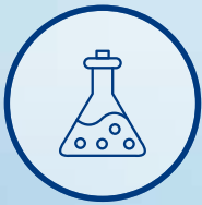
Environment friendly Marine Chemicals