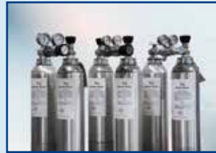
ISO 17034 and ISO 17025 certified specialty & calibration gases.